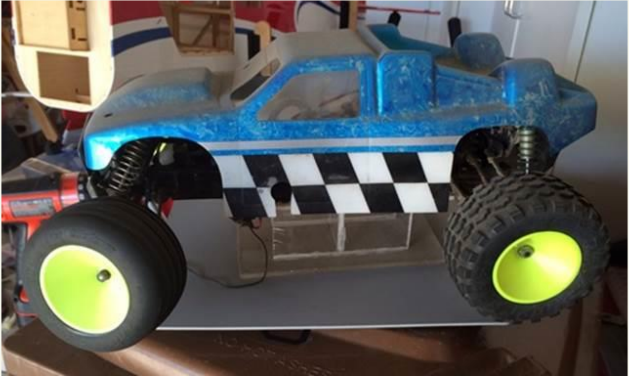
Associated RC10GT gas car