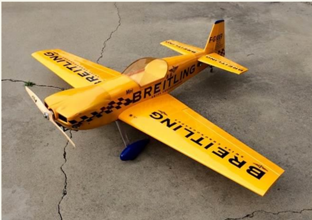
Sig Cap 231