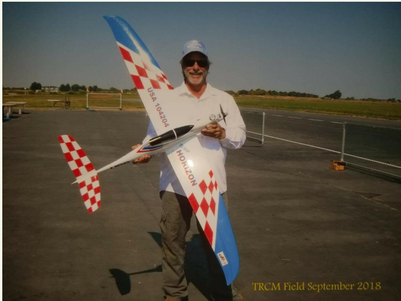
TRCM Field September 2018