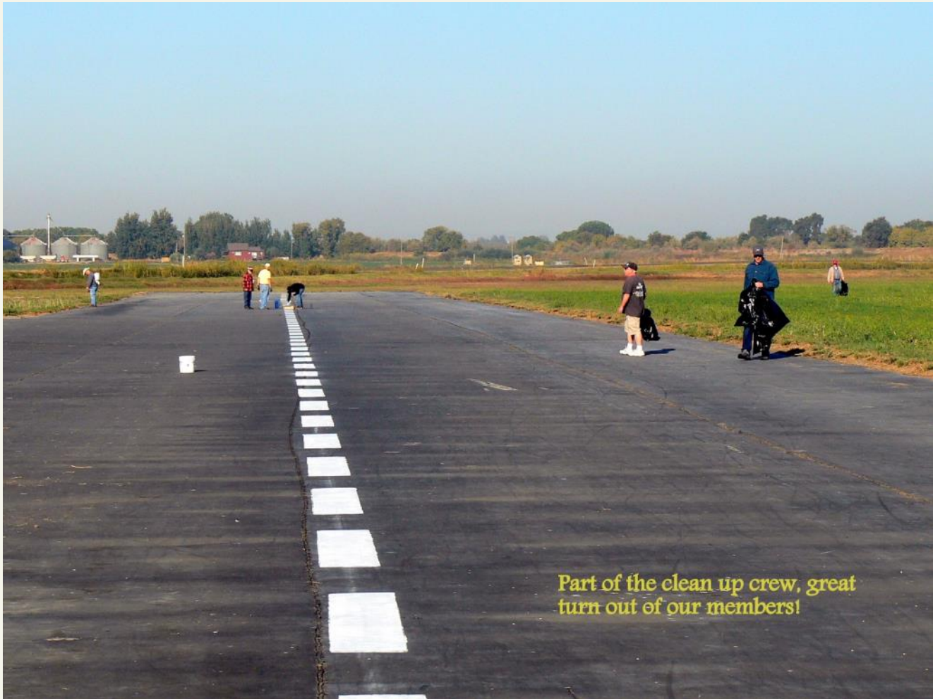
Part of the clean up crew, great turn out of our members!