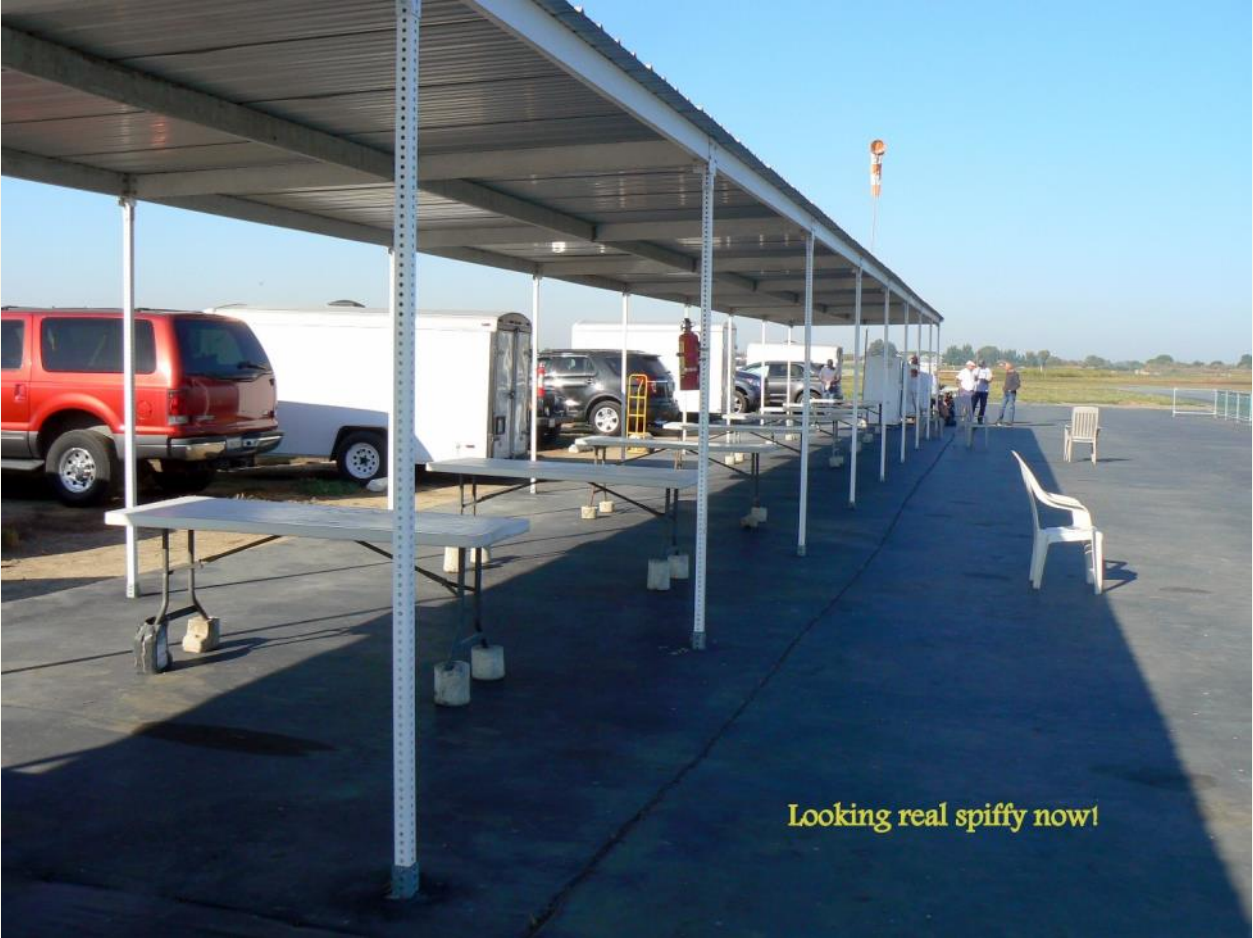
Looking real spiffy now!