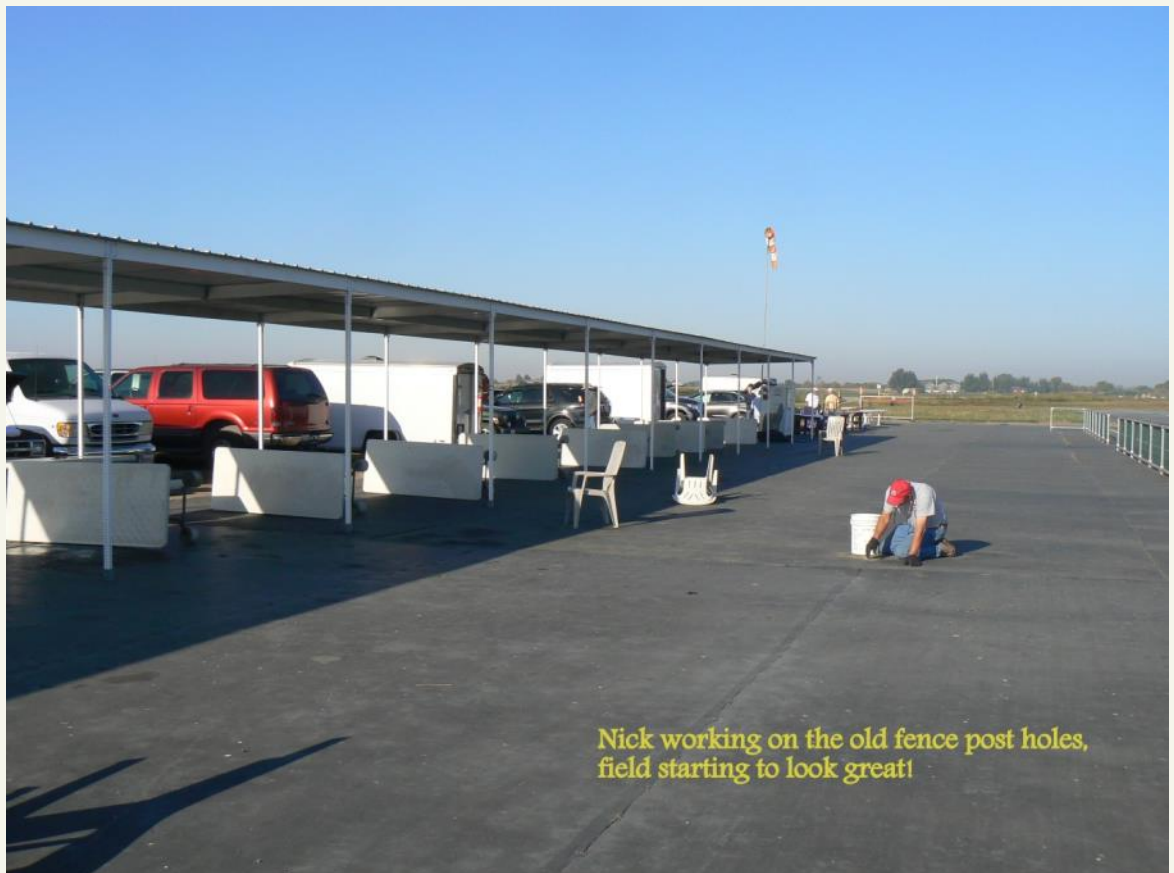
Nick working on the old fence post holes, field starting to look great!