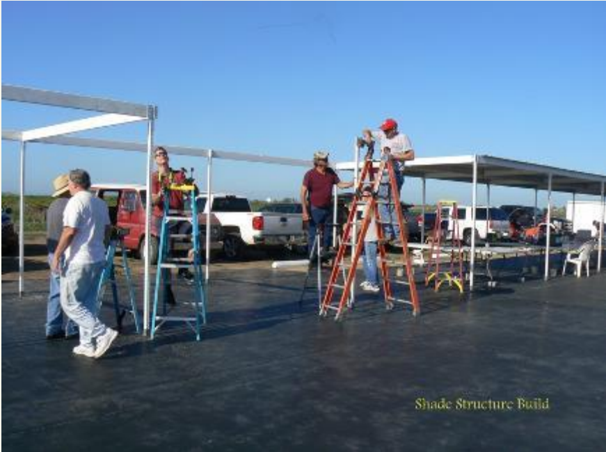
Shade Structure Build