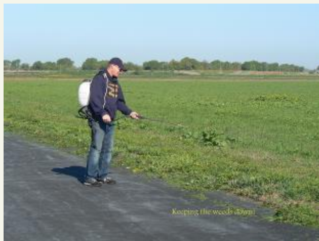
Keeping the weeds down!