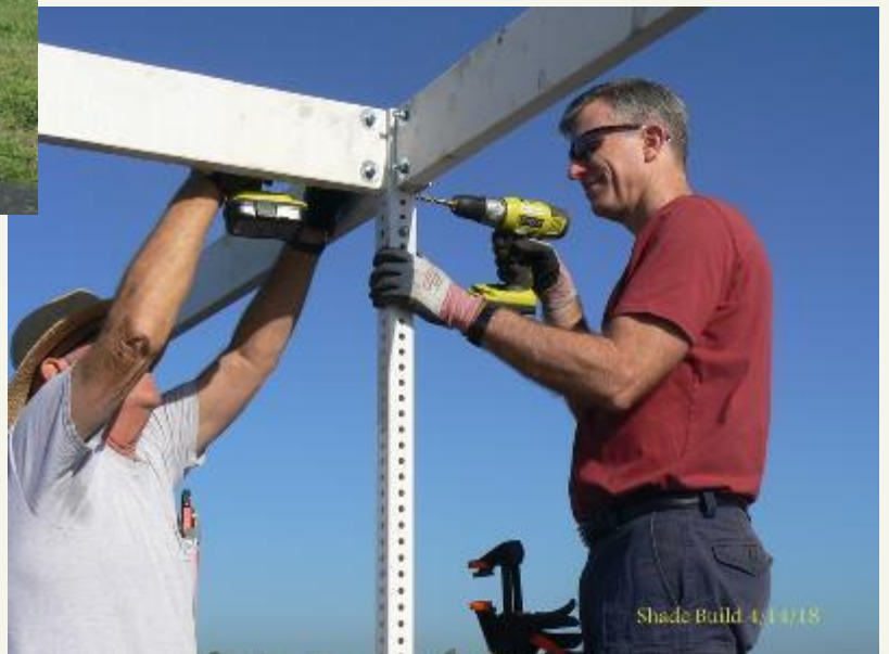
Shade Build 4/14/18