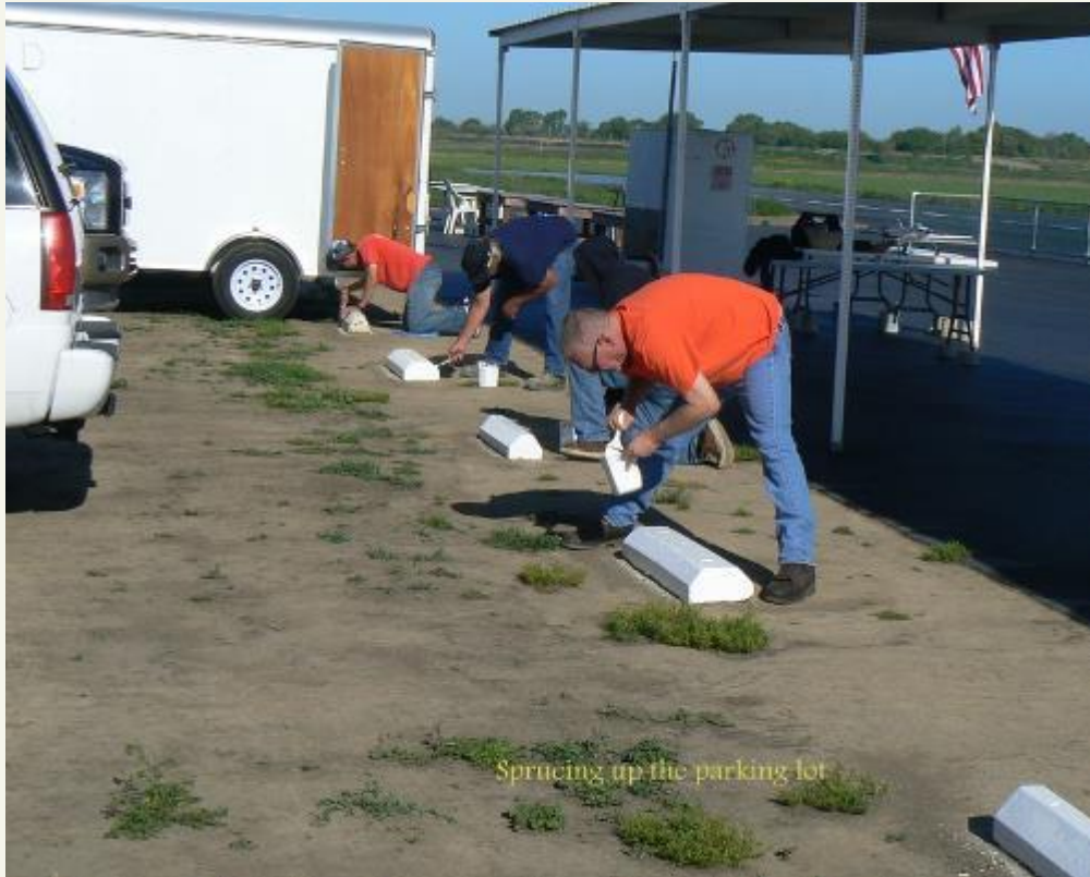
Sprucing up the parking lot