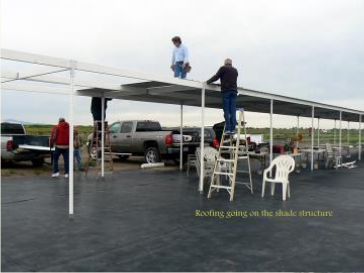
Roofing going on the shade structure