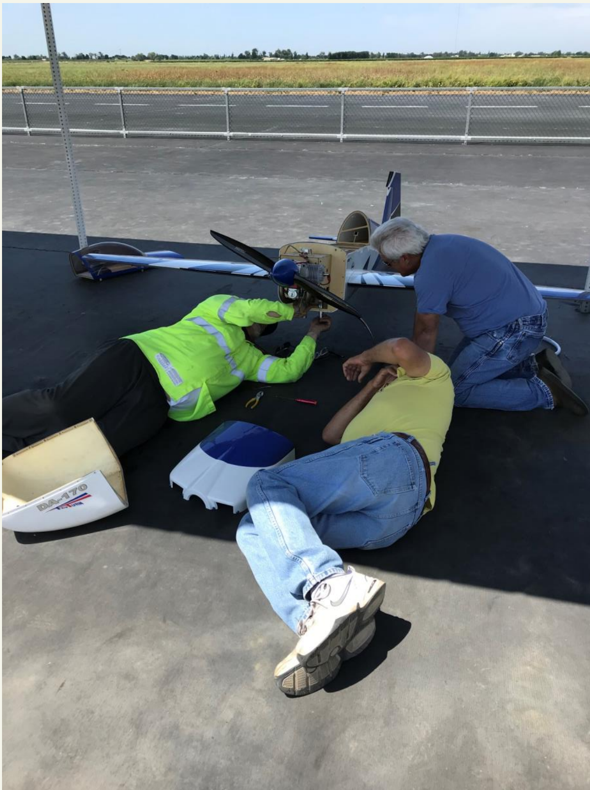
When It's time to get down and dirty and get something fixed, the TOKAY modelers will get down and dirty. Whatever it takes, and shows the spirit of the club we belong to.