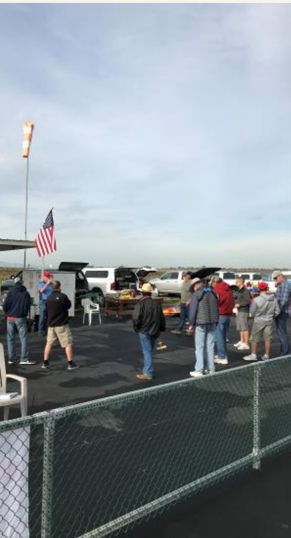
Everyone gathering around for the pilot meeting before the start of the “IMAC experience”