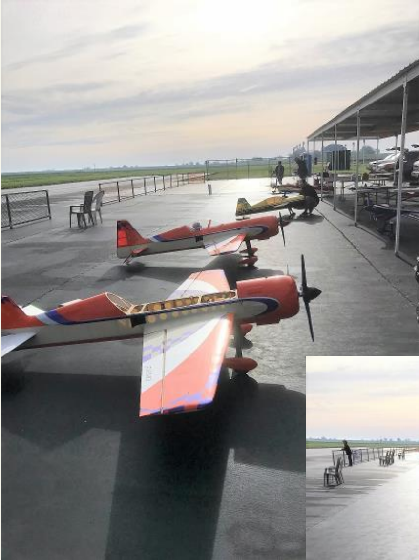
Early morning, getting ready for the IMAC Experience. Flightline