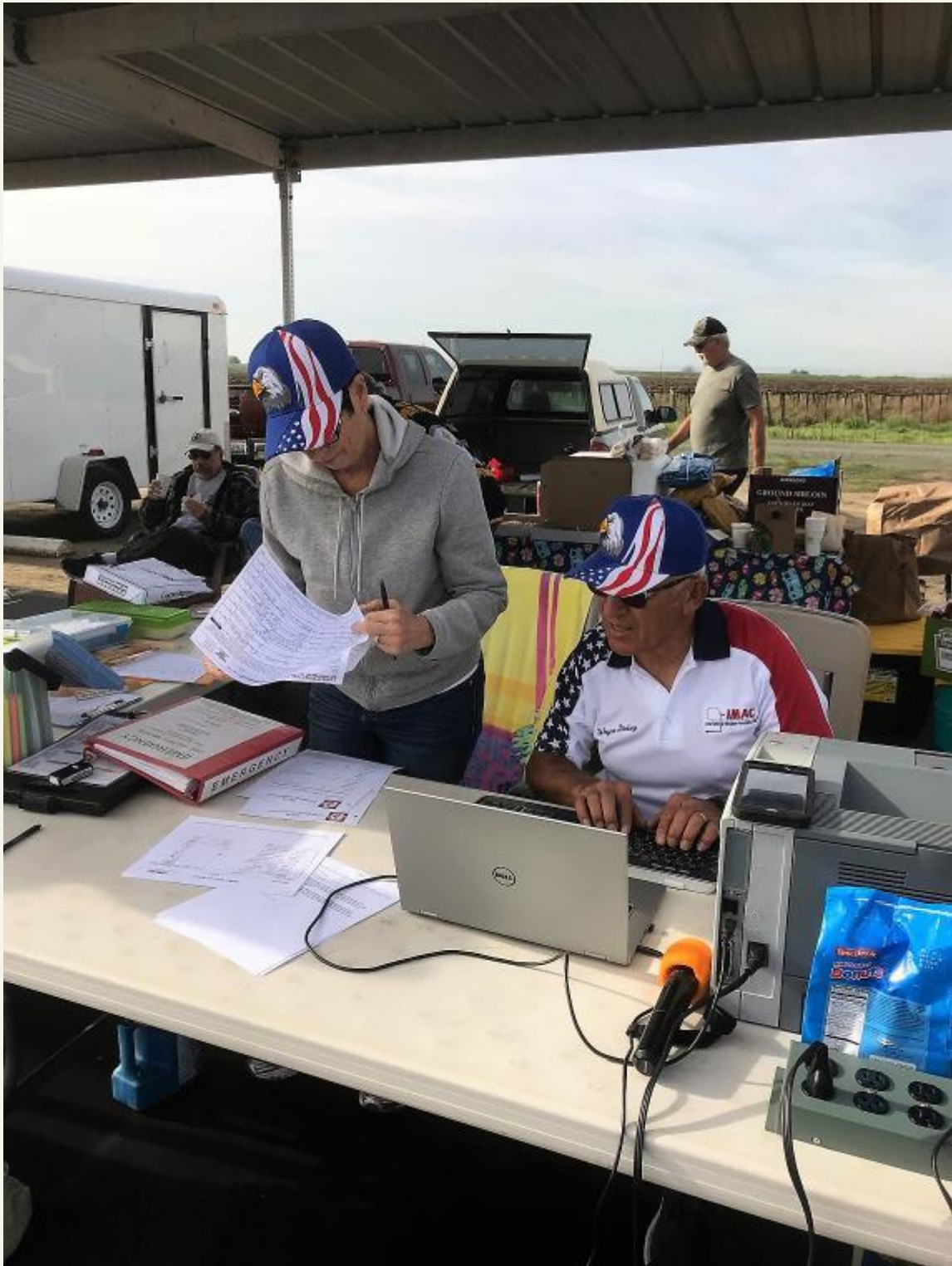
IMAC Experience registration. Just like the real deal