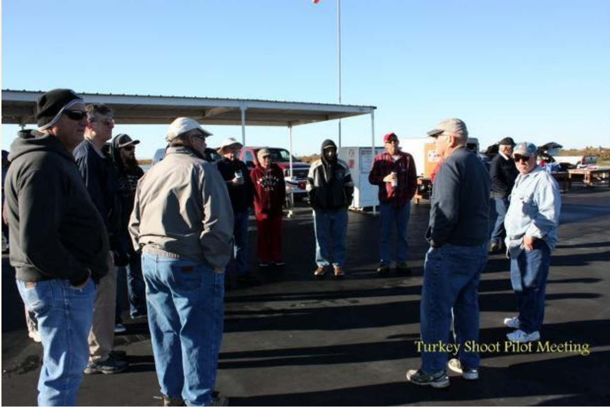
Turkey Shoot Pilot Meeting