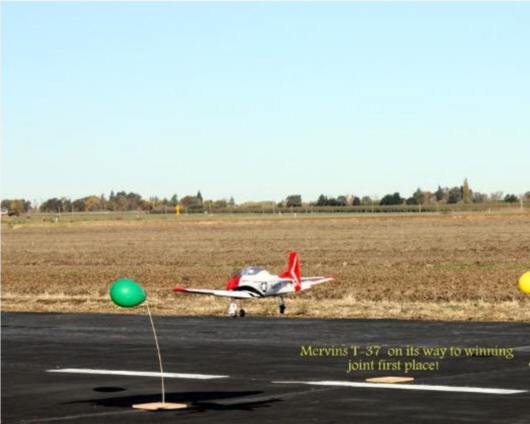
Mervin's '1-37 on its way to winning joint first place!