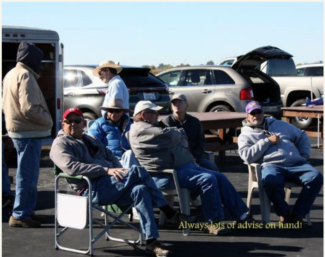
Always lots of advise on hand!