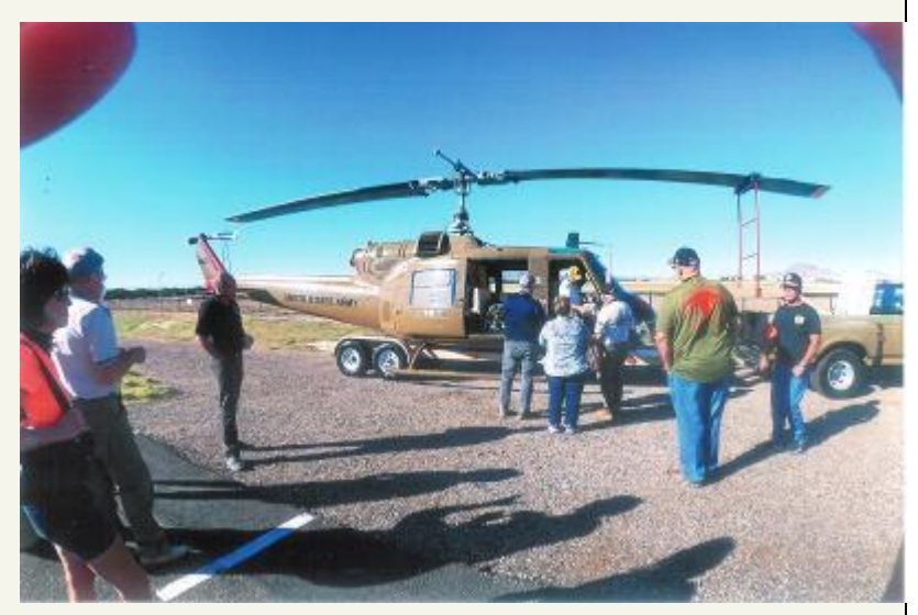
a few pictures of CAF airplanes