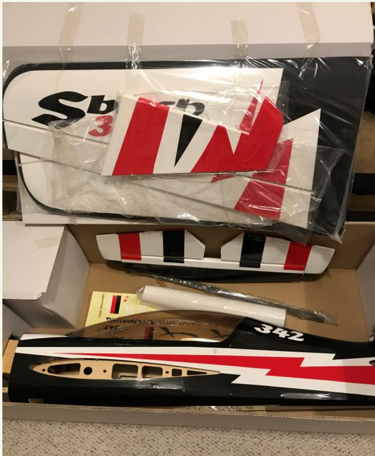
Sbach 342 next on the work bench with a DLE35RA engine.