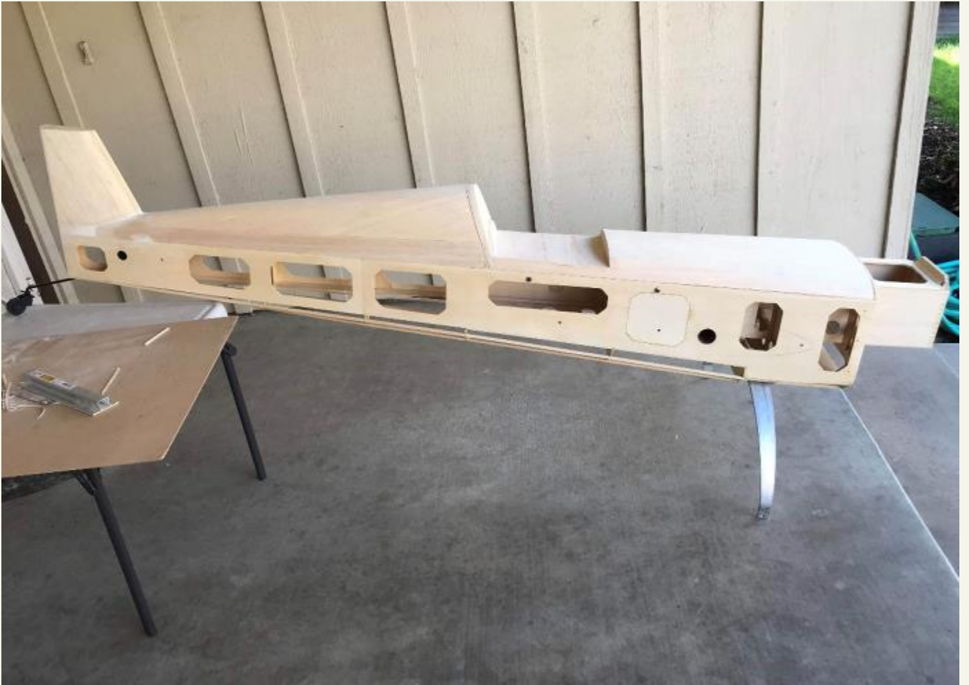
Wally and his project plane, ready to cover